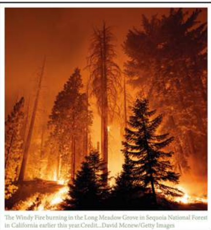
The Windy Fire burning in the Long Meadow Grove in Sequoia National Forest in California earlier this year.

You didn't really think we were going to do a Covid drink, did you? That's far too easy! Instead, for the drink of this decade, we've turned our heads to the climate crisis. 2020 saw a record-breaking amount of wildfires in California, and it kinda feels like that picture of the cartoon dog in the burning room, but this is *not* fine.